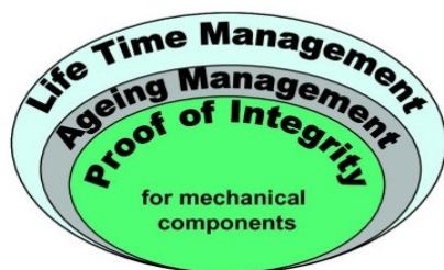
Fig. 1. The relationship between the processes of the life time management, SSC ageing management and proof of integrity for mechanical components

The relationship between the processes of LM, aging management of NPP systems, structures and components (SSC) and ensuring or proof their structural integrity is shown schematically in Fig. 1 [4].