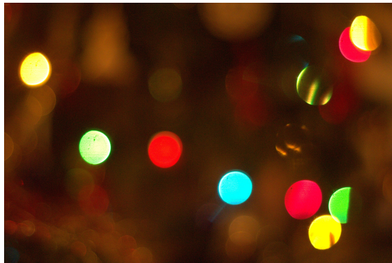
Figure 1. Tested image.

Our test system contains an AMD Ryzen 5 3600 processor @ 4.35 GHz and an Nvidia GTX 960 graphics card with 4 GB memory. The following effects were used in order to compare the performance of the different executing branches: basic modifications, edge detection, Gauss filter, infrared and grayscale effects. As for basic modifications, we are talking about exposure value and brightness. To obtain the execution times we used the QElapsedTimer class, which measures the elapsed time in nanoseconds. Because the magnitude of the running time of our algorithms is millisecond, after readout, the timer variable is divided by 1 000 000 in order to yield values of milliseconds. The measured times in the figures represent only the runtimes of the effect executions without the bus transfer between the main memory and the video card. The effects were tested with multiple images and according to our observation the size of the image and the execution time is in linear relationship. The results below were measured with a 4608 \times 3072 PNG image (see Figure 1). The color depth and the number of color channels do not affect the results since the program converts every image to single-precision floating-point format.