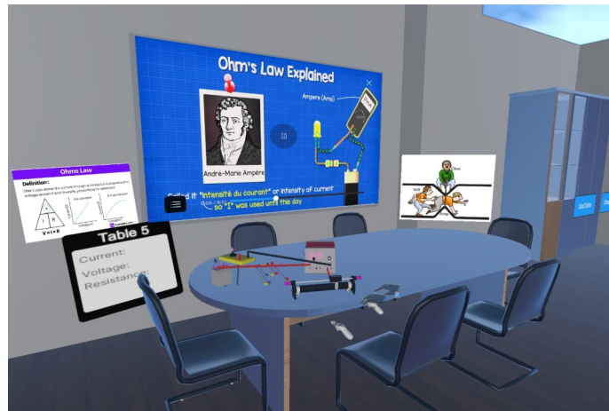
Figure 2: Screenshot of the virtual laboratory work “Study of Ohm's law for a section of a circuit”

Another virtual laboratory experiment is dedicated to determining the moment of inertia of a sphere (Figure 3). In this experiment, users observe the motion of a sphere along an inclined plane, measure its movement parameters, and calculate the moment of inertia based on its radius and mass. This enables students to grasp the fundamental principles of rotational dynamics and their practical applications.