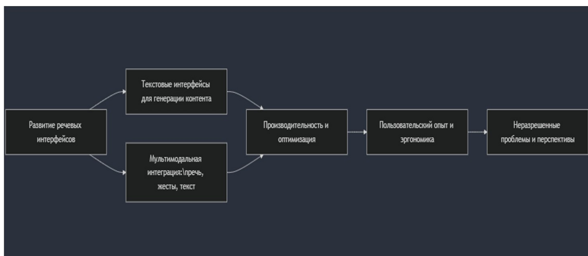
Figure 1: Main Research Directions

In the field of text interfaces for virtual content generation, a significant breakthrough is associated with the work of Chen and Li (2023), who introduced the concept of "semantic anchors" – special text markers allowing precise description of spatial relationships between generated objects. Their approach was successfully expanded in Thompson et al.'s (2024) research, adding support for temporal descriptions to create animated scenes [17].