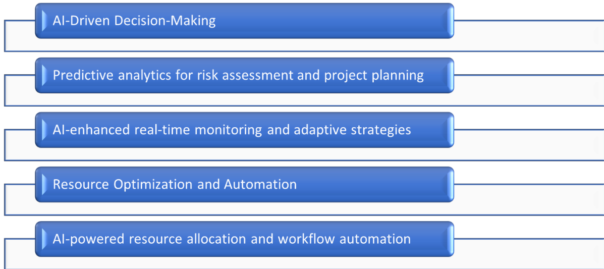
Figure 3: Conceptual Model Managing digital transformation projects under the influence of AI.

This model provides a structured approach to understanding how AI can be effectively integrated into digital transformation projects, ensuring both efficiency and ethical responsibility.