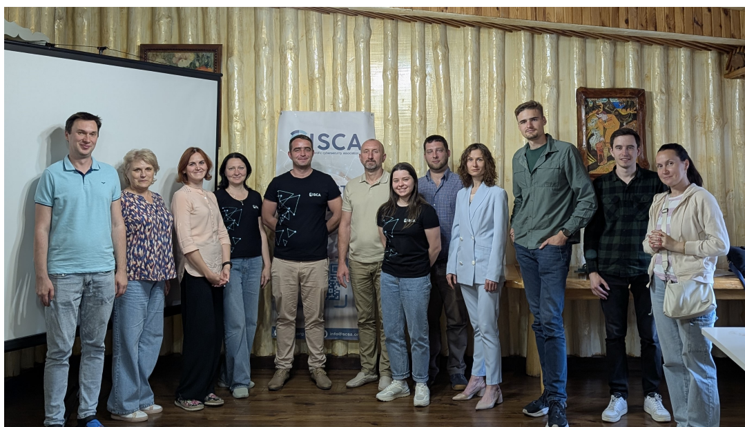
Figure 1: Participants of Session 1.2 of Workshop on Cyber Hygiene.