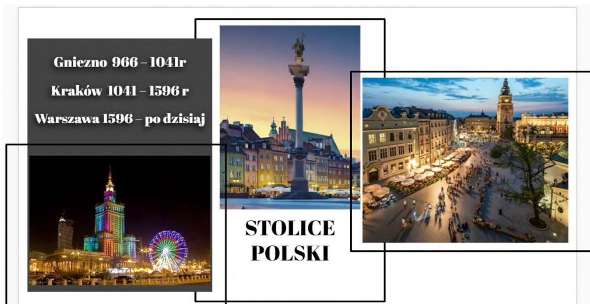
Figure 2: Example of a presentation created by students during a distance learning course.