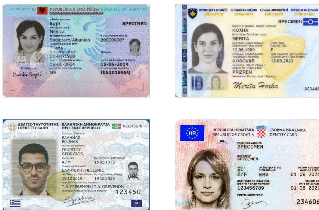
Figure 2: Specimens for the Albania, Kosovo, Greece, Croatia ID Cards (tiles from the upper left side to the lower right side).

As previously explained, the first step of the experiment is the acquiring of ID Cards for some European countries. In the following image there are shown some samples (specimens) of real ID Cards utilized for experimentations (all specimens were extracted from the specific Wikipedia pages of the ID Cards of each of the above countries):